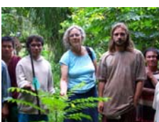
Mahogany sapling planted at remote Nueva Yarina