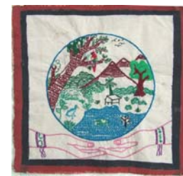
Caring for Creation