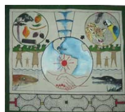
Calendar cover art

SeedTree sponsored Oct 2007 - Sept 2008: funded by seed grants sg, circulating Community Environmental Trust Funds cef or as part of our 17 last Rural Environmental Eco-Ed. Classes ee (latter partial list: also ) 10 New classes are now in progress.