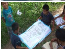
2 Schools include trees in curricula