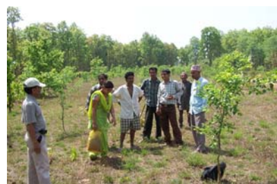
Young saplings fill gaps in the recovering Dang forest entrusted into community care through Nepal’s progressive community forest legislation.

For a sustainable future, the socio-economic system must give sufficient incentive to sustainable solutions. Since 1989 Nepal’s provision for even poor and landless people to benefit by developing sustainable forest management on government lands. This has coincided with an increase of forest cover, despite the long civil unrest.