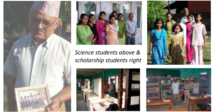
Science students above & scholarship students right